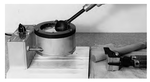
Promptly and properly dispose the dross or oxides skimmed off the molten metal.